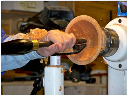
HOLLOWING THE TOP USING A BOWL GOUGE. THE INSIDE DOES NOT HAVE TO BE SANDED OR REFINED.

From our last Newsletter there were 2 web sites included. Copy and paste the into your browser and it will take you there. www.thompsonlathetools.com