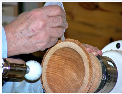
GLUING THE JOINT OF THE BOTTOM THAT WILL FIT TO THE TOP. THIS IS MEDIUM CA GLUE AROUND THE INSIDE OF THE TENON.