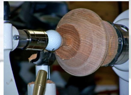
LINE UP THE GRAIN OF THE TOP WITH THE BOTTOM AND PUSH TOGETHER WITH THE GOLFBALL FITTED TAIL.