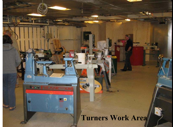
Turners Work Area