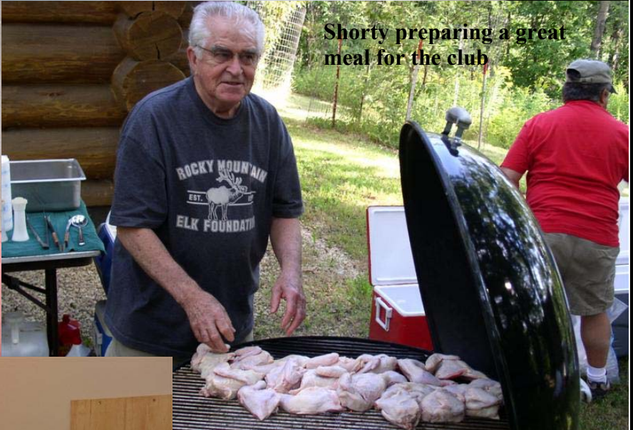
Shorty preparing a great meal for the club