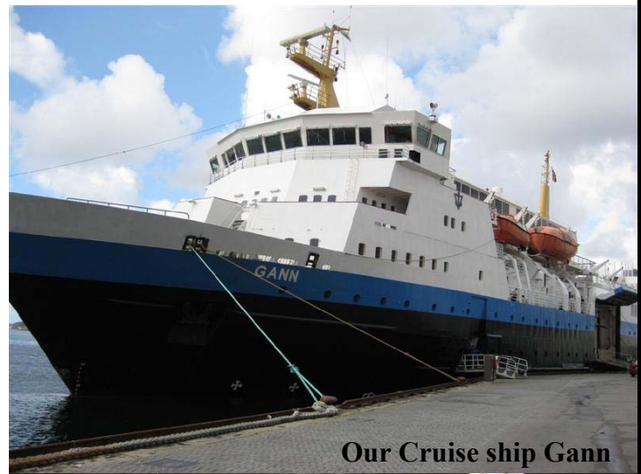
Our Cruise ship Gann