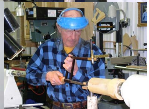
March Meeting Photos