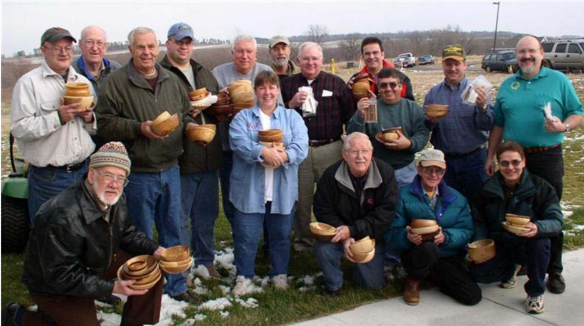
CRW members who turned the Operation Homefront Pens and Holmen High Bowls