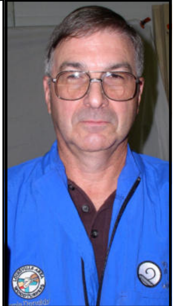
The Cranky Turner emailed that he thought the appropriate caption for this picture is - ACHTUNG!