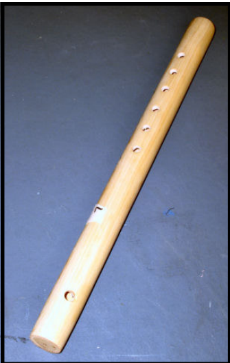
More entries from the 2x4 Challenge.

11 to defend the posting to this forum saying that we all use light bulbs and therefore the posts are relevant to this forum. 36 to debate which method of changing light bulbs is superior, where to buy the best light bulbs, what brand of light bulbs work best for this technique and what brands are faulty. 7 to post URL's where one can see examples of different light bulbs. 4 to post that the URL's were posted incorrectly and then post the corrected URL's. 3 to post about links they found from the URL's that are relevant to this group which makes light bulbs relevant to this group. 13 to link all posts to date, quote them in their entirety including all headers and signatures, and add "Me too". 5 to post to the group that they will no longer post because they cannot handle the light bulb controversy. 4 to say "didn't we go through this already a short time ago?" 13 to say "do a Google search on light bulbs before posting questions about light bulbs". 1 forum lurker to respond to the original post 6 months from now and start it all over again.