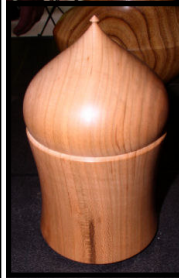
3 Grunke boxes.