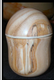
Walnut bowl, right, turner unidentified.