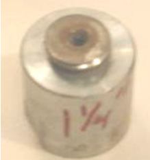
1/4" x 8 TPI Reed Hub - $20