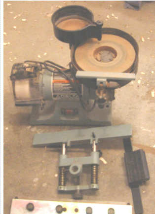
Delta Sharpening System w/ planer knife jig - $150