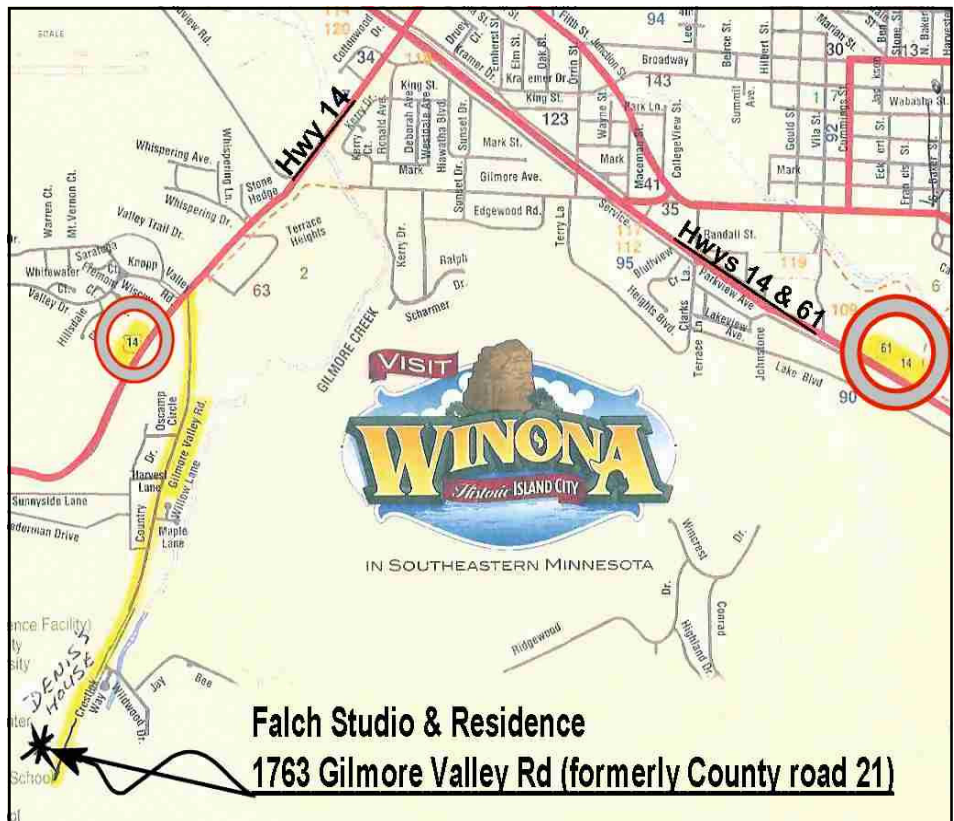
Falch Studio & Residence 1763 Gilmore Valley Rd (formerly County road 21)

We'll have coffee, so donuts are ALWAYS welcome. And maybe something chocolate for that special person.