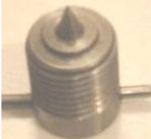
1/4" x 8 TPI Center Finder - $15