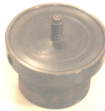
1/4" x 8 TPI x 3" Screw Chuck - $25