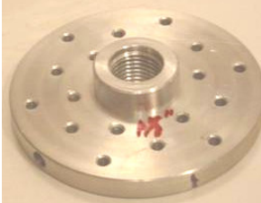
1/4" x 8 TPI x 6" Faceplate - $30