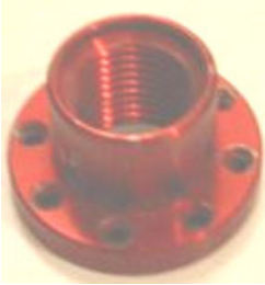
1/4" x 8 TPI x 2" Faceplate - $15

CRW member Duane Hill is having a clearance sale.